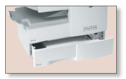
Standard 250-sheet adjustable paper tray